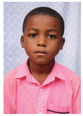
Itenor 3 years later